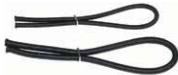
RS316BLK 3/16" SHOCKCORD RS014BLK 1/4" SHOCKCORD