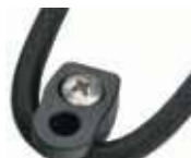
78510001 BUNGEE HOOK 8031961 SCREW